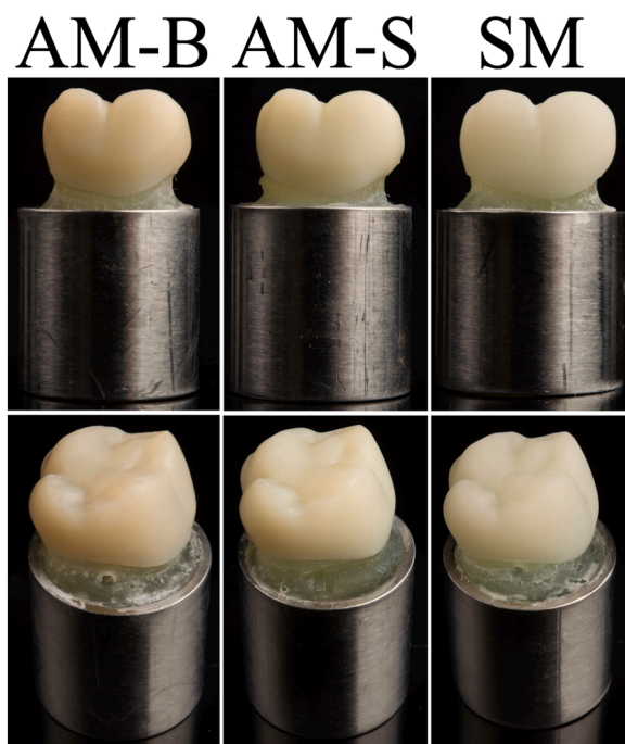
Fig. 1. Representative images of one crown from each material subgroup after cementation. AM-B; VarseoSmile Crown Plus. AM-S; Crowntec. SM; Vita Enamic.

Similar to the results of previous studies on the fracture resistance of