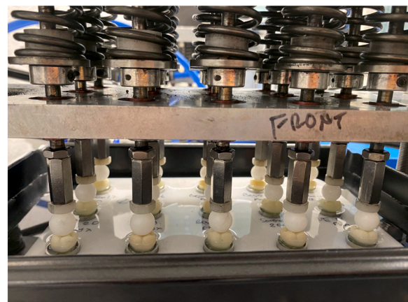
Fig. 2. Cyclic loading setup used in this study.